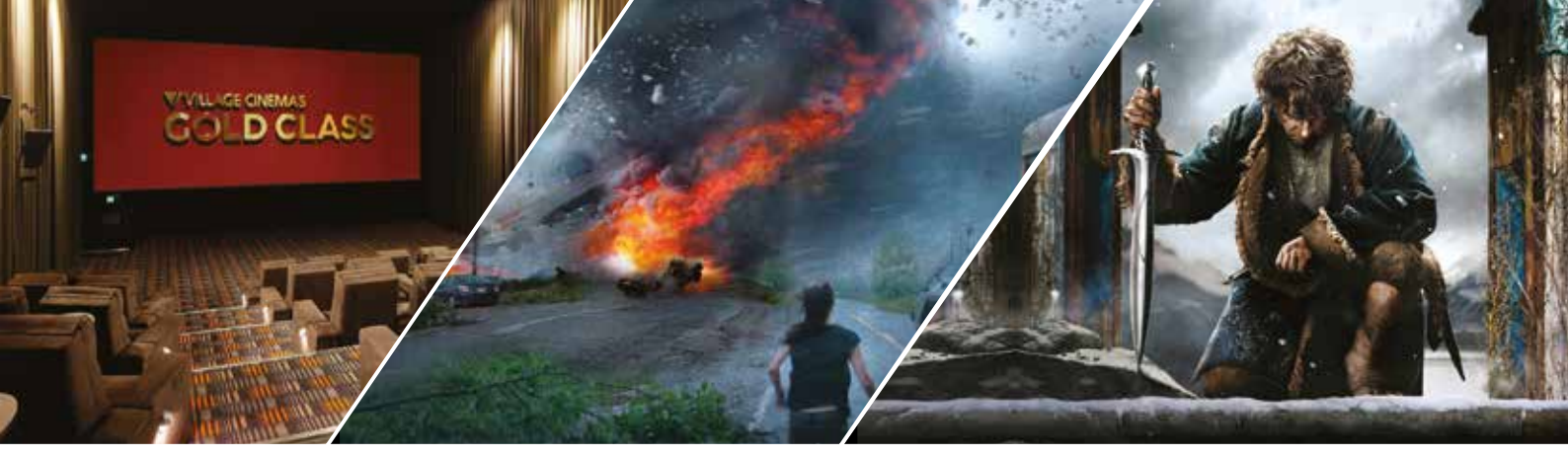
IMAGES: L to R - Village Cinemas Gold Class; Into the Storm; The Hobbit: The Battle of the Five Armies

of 40 cents per share have also been paid (25 cents per share was paid in December 2013 comprising a capital return of 12 cents per share and a fully-franked distribution of 13 cents per share). A further fully-franked special dividend of 15 cents per share was paid to shareholders in July 2014 and the VRL Board has also declared a fully-franked final dividend of 14 cents per share in relation to the 2014 financial year, which was paid to shareholders in October 2014.